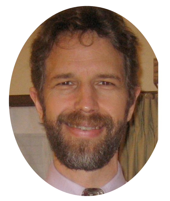
Editor's note- This article was originally published in the The Global Japanese Studies Review, Meiji University (明治大学国際日本学研究), 2(1), 51-76.. It has been reprinted here with the writer's permission. The writer offered to create a shorter article on the study for ERJ, but the editor felt it was important for our readers to be able to read the original article in its entirety.